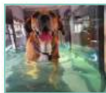
1-8 KM/H UP TO 150KG