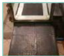
EASY ACCESSIBLE RAMPS