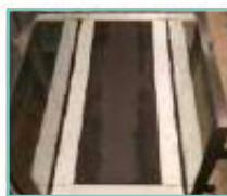
PLATFORMS INSIDE THE CHAMBER