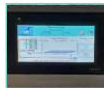
STANDARD CONTROL PANEL SPEED AND ANGLE WILL BE VISIBLE ON A DISPLAY.