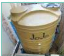
1700 L STORAGE TANK