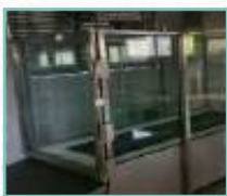
360 GLASS WALLS.

The speed of the treadmill can be customized to each pet based on the length of the pets' legs and how much exertion the pet is putting forth.