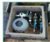
STANDARD PUMP AND FILTER ECO FRIENDLY HEATING SYSTEM