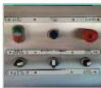
ADJUSTABLE SPEEDS FORWARD AND REVERSE FUNCTIONS EMERGENCY STOP